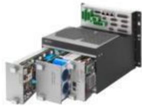
Two axes – 9"