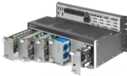
Eight axes – 19"