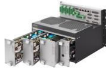
Six axes – 11"