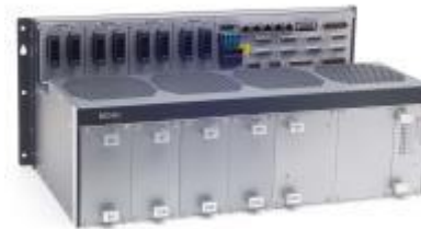
Eight axes – 22"